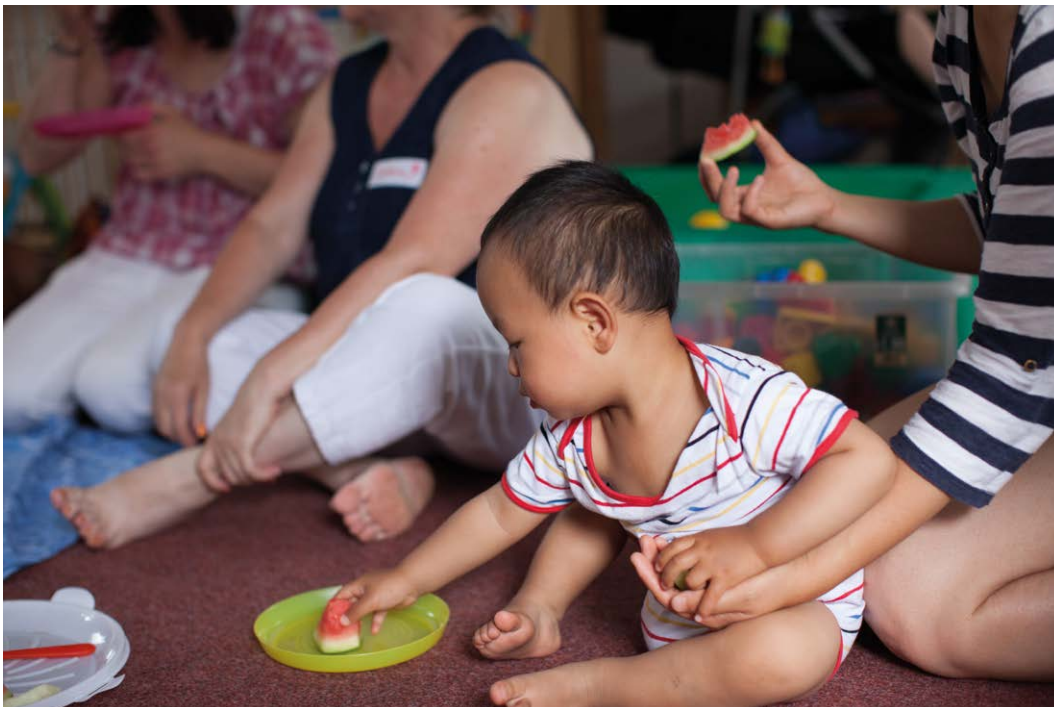
Teaching the key elements of a healthy family lifestyle: The 8-week HENRY family programme.