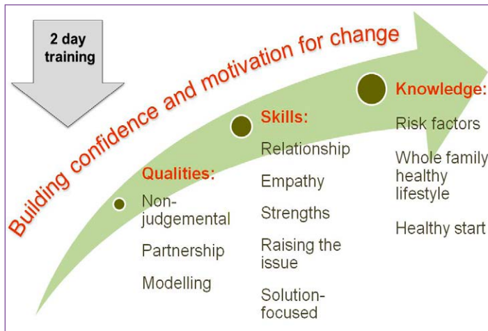
Figure 2. The HENRY 2-day practitioner training outline.